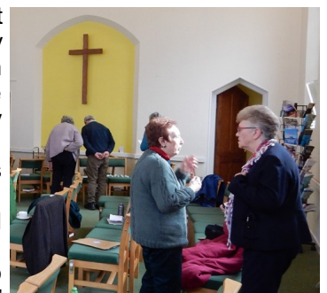
Thy Kingdom Come training event at Leominster Methodist Church